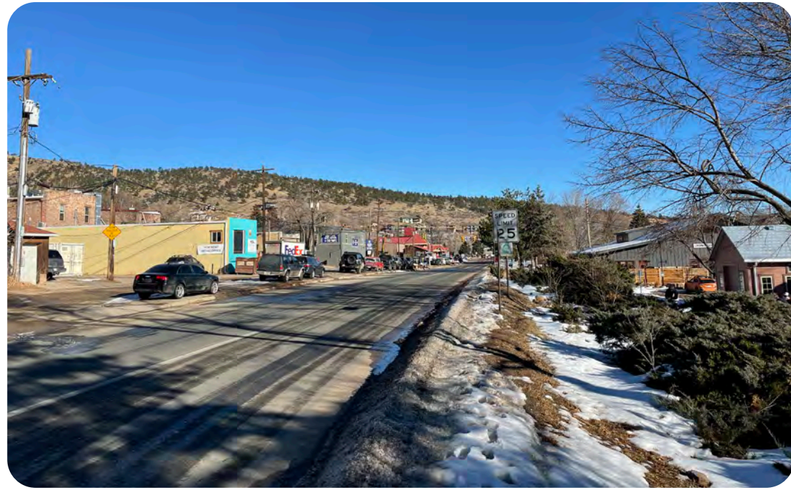
Broadway between 5th and 4th, looking east