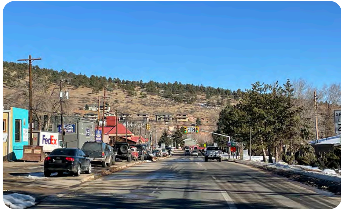
Broadway between 5th and 4th, looking east