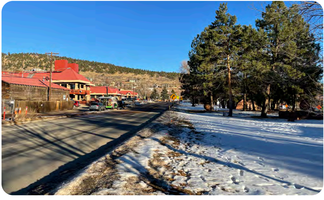
Broadway between 4th and 3rd, looking east