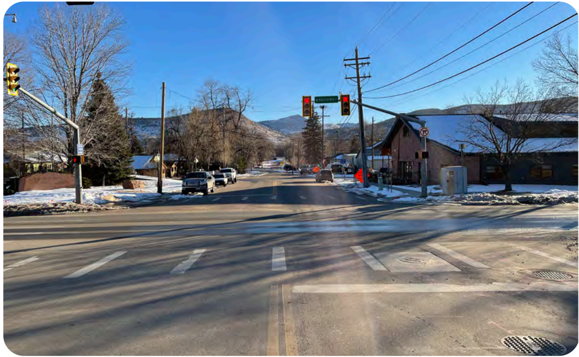
Intersection of Broadway and 4th, looking south