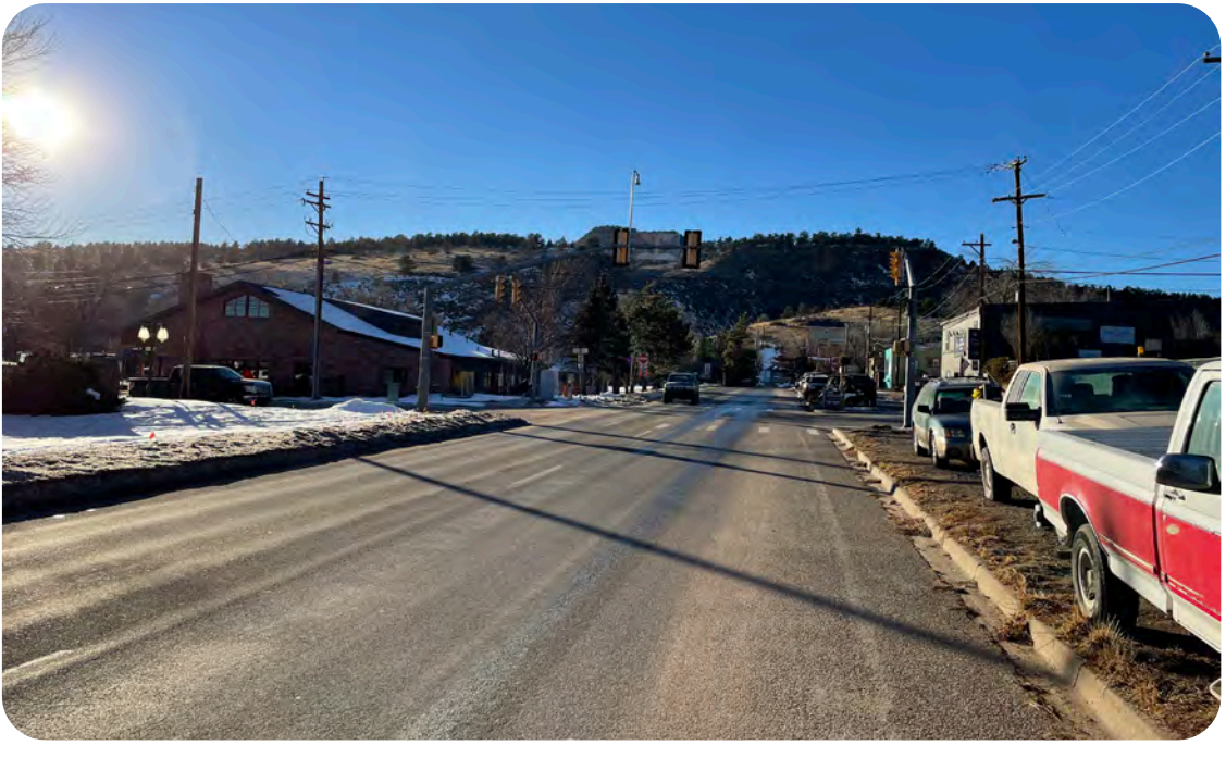
Broadway between 4th and 3rd, looking west