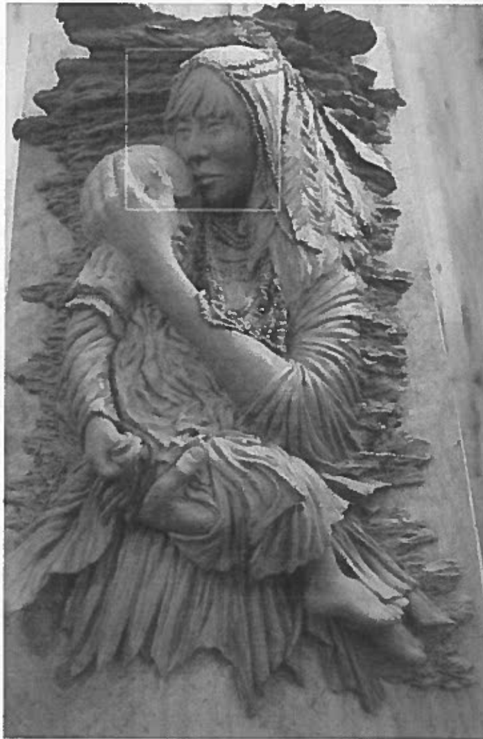
Attachment 1 : Image of Protectors , by Eileen Coughlin Turnbull