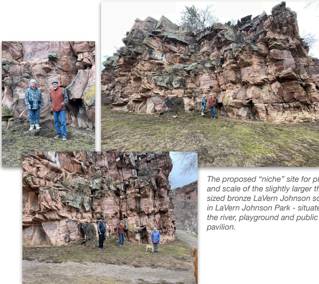
The proposed "niche" site for placement and scale of the slightly larger than life-sized bronze LaVern Johnson sculpture in LaVern Johnson Park - situated near the river, playground and public picnic pavilion.

An enveloping site has been earmarked in LaVern Johnson Park, surrounded by beauty in a natural niche created by cliffs, near the river, playground and picnic pavilion. It's been envisioned that the round base of the sculpture would have the quote she is most known for inscribed encircling it: "Lead, follow or get out of the way."