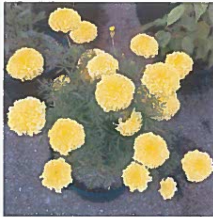
Primrose Inca Marigold