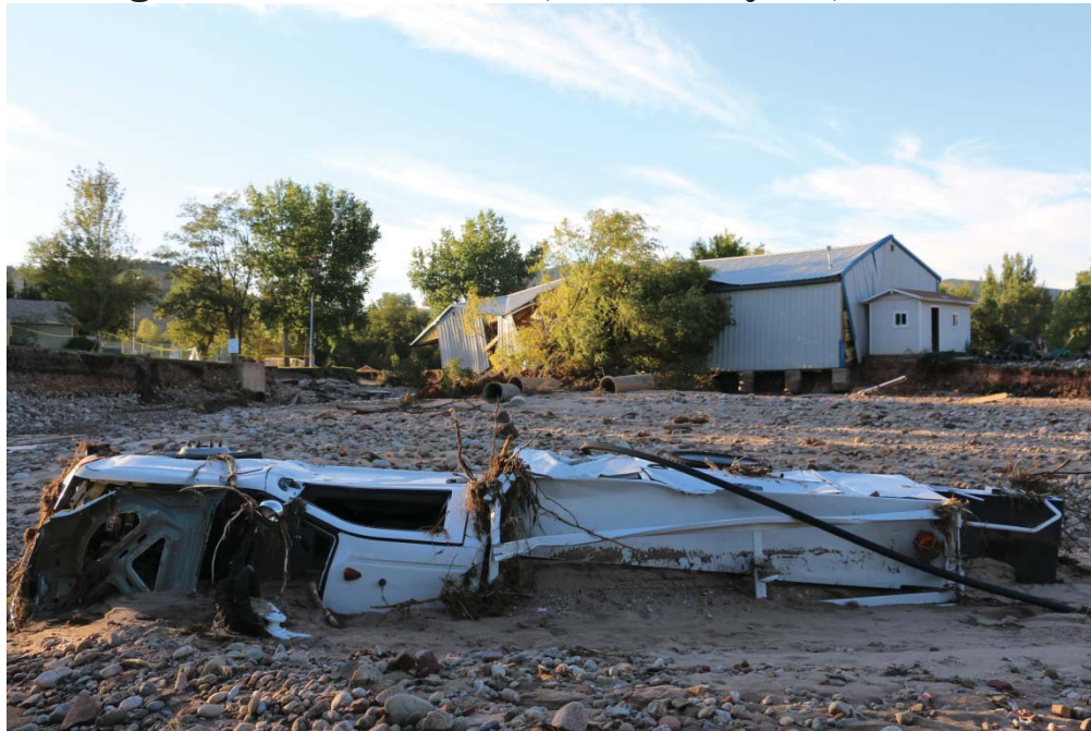
Figure 1: After the Flood; Town of Lyons, Colorado

northwest of Denver. The disaster’s floodwaters significantly damaged the Town, washing out roads, bridges, trails, and streams; isolating residents from evacuation routes; and damaging the Town’s electrical, sewage, and potable water services. The flood also destroyed the Town’s Public Works facilities and equipment, the Town Hall, and Library.